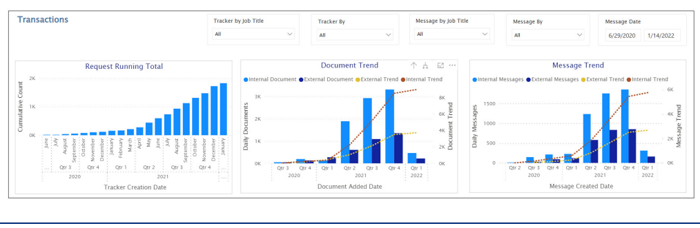
Figure 3: Internal Tracker Landing Page